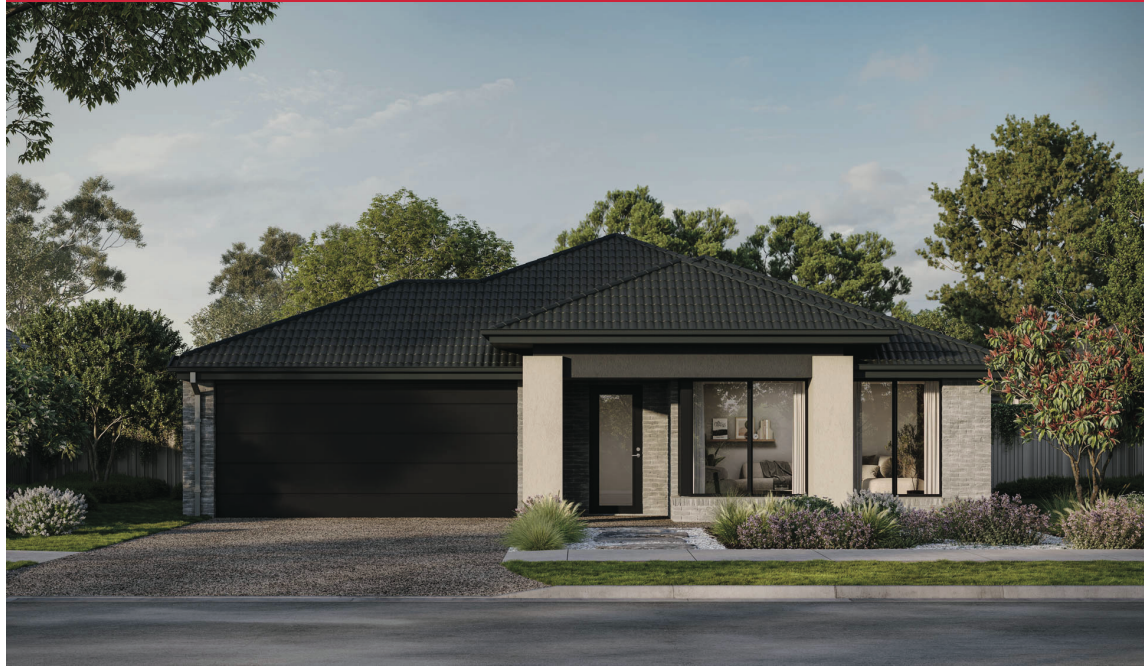
TAMWORTH 32 | ELEVATE RANGE