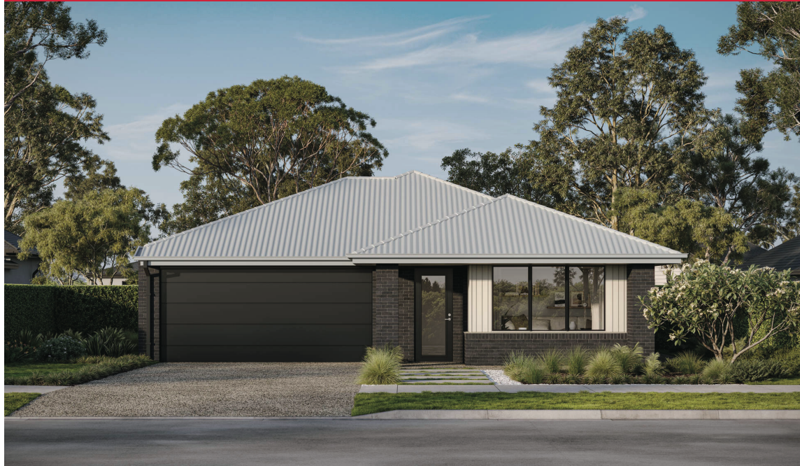
GRAMPIAN 22 | EMERGE RANGE