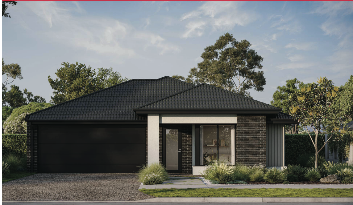
GRANITE 23 | EMERGE RANGE