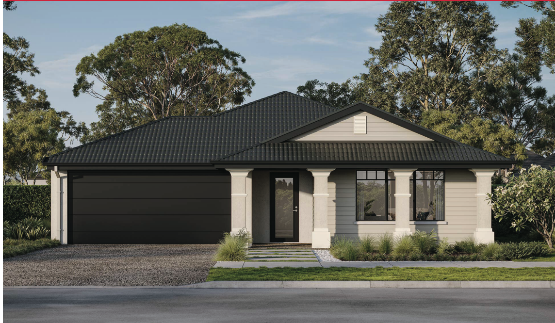
BERRIMA 28 | ELEVATE RANGE