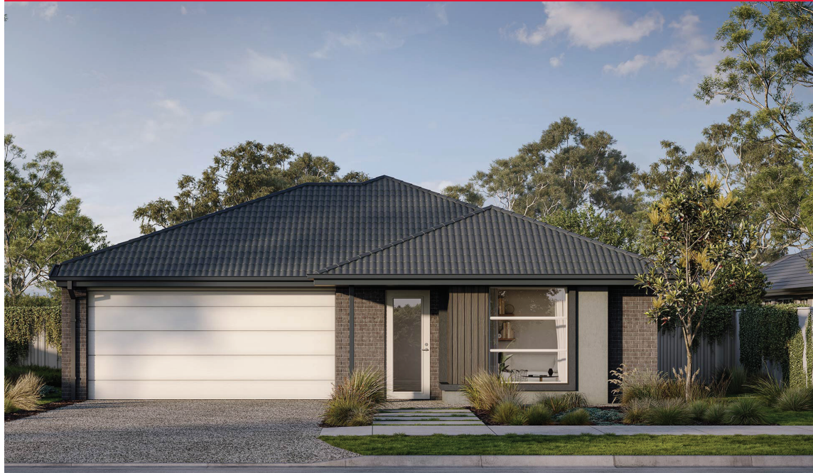
GRANITE 22 | EMERGE RANGE