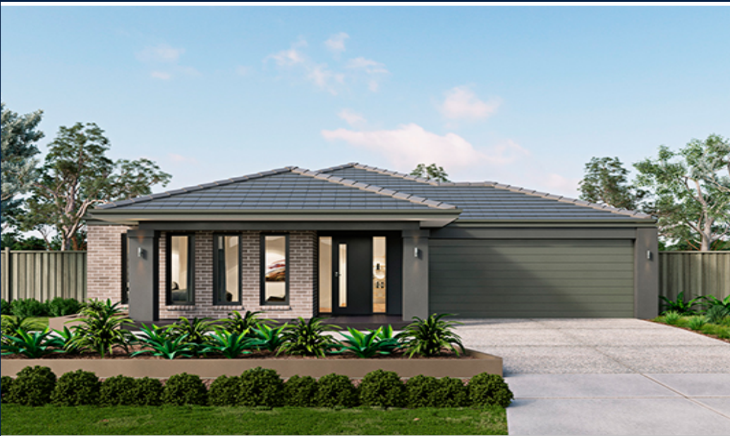
Price excludes upgrade items above standard specification such as feature render and bricks, front entrance timber decking, front entry door, brick infills above garage, external lighting, fencing, concrete paths and driveway. Façade Image may also contain items not supplied by Metricon Homes, namely landscaping and planter boxes.