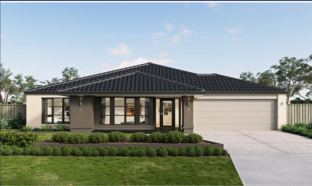
Price excludes upgrade items above standard specification such as feature render and bricks, front entrance timber decking, front entry door, brick infills above garage, external lighting, fencing, concrete paths and driveway. Facade Image may also contain items not supplied by Metricon Homes, namely landscaping and planter boxes.